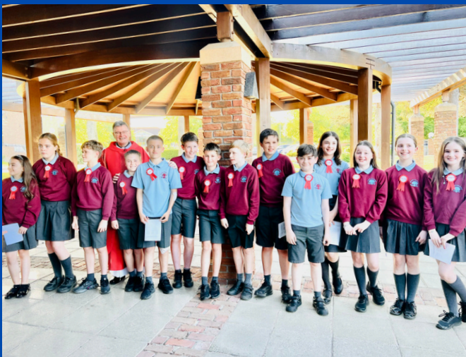
Congratulations to our P7 pupils in The Ashleigh Group who recently made their Confirmation at St Brigid's Parish.