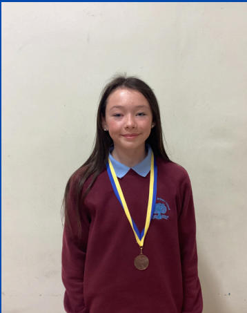
Sofia won a bronze medal for the long jump at an athletics event in North Down.