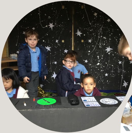
P1 making buns in the mud kitchen and exploring the universe in their space staion.