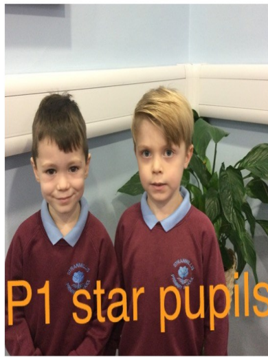
P1 star pupils