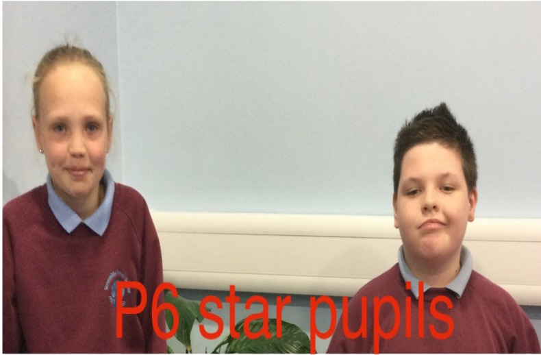
P6 star pupils