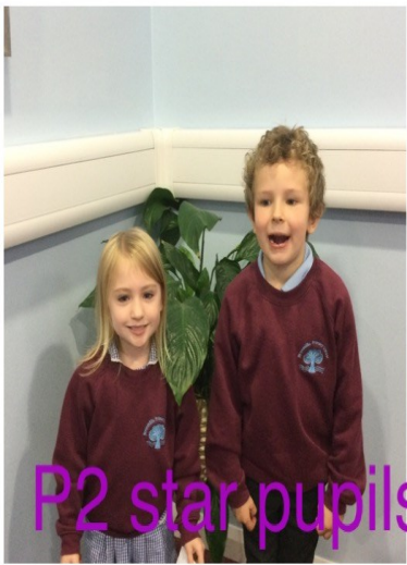
P2 star pupils