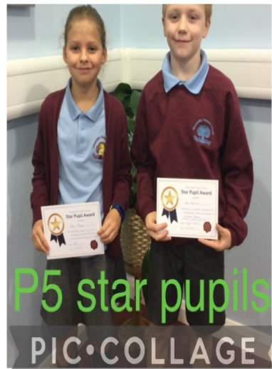
P5 star pupils