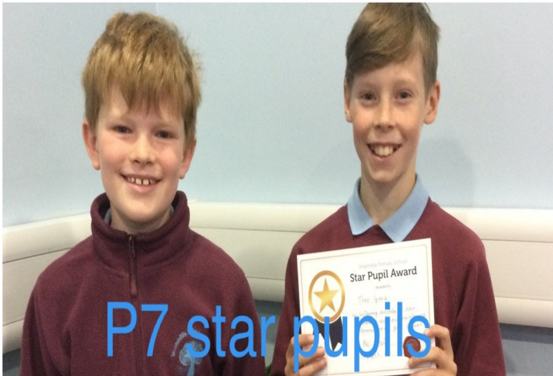
P7 star pupils