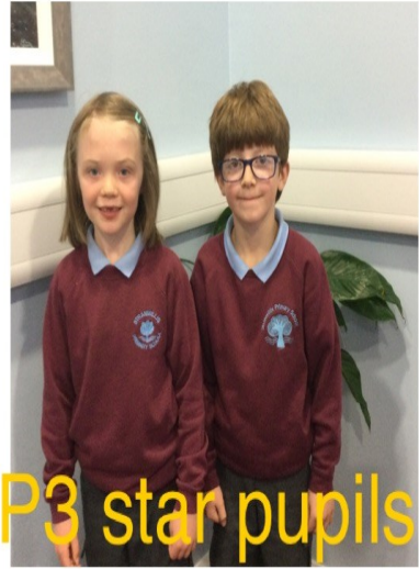
P3 star pupils