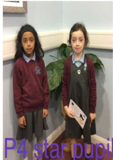
P4 star pupils